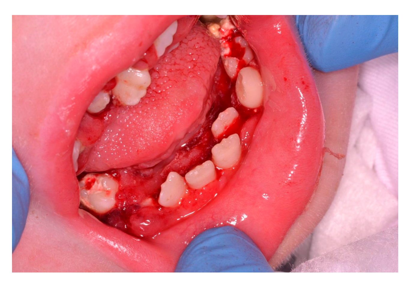
Figure 4. Patient reported in Figure 3 after dental treatment at the bedside.