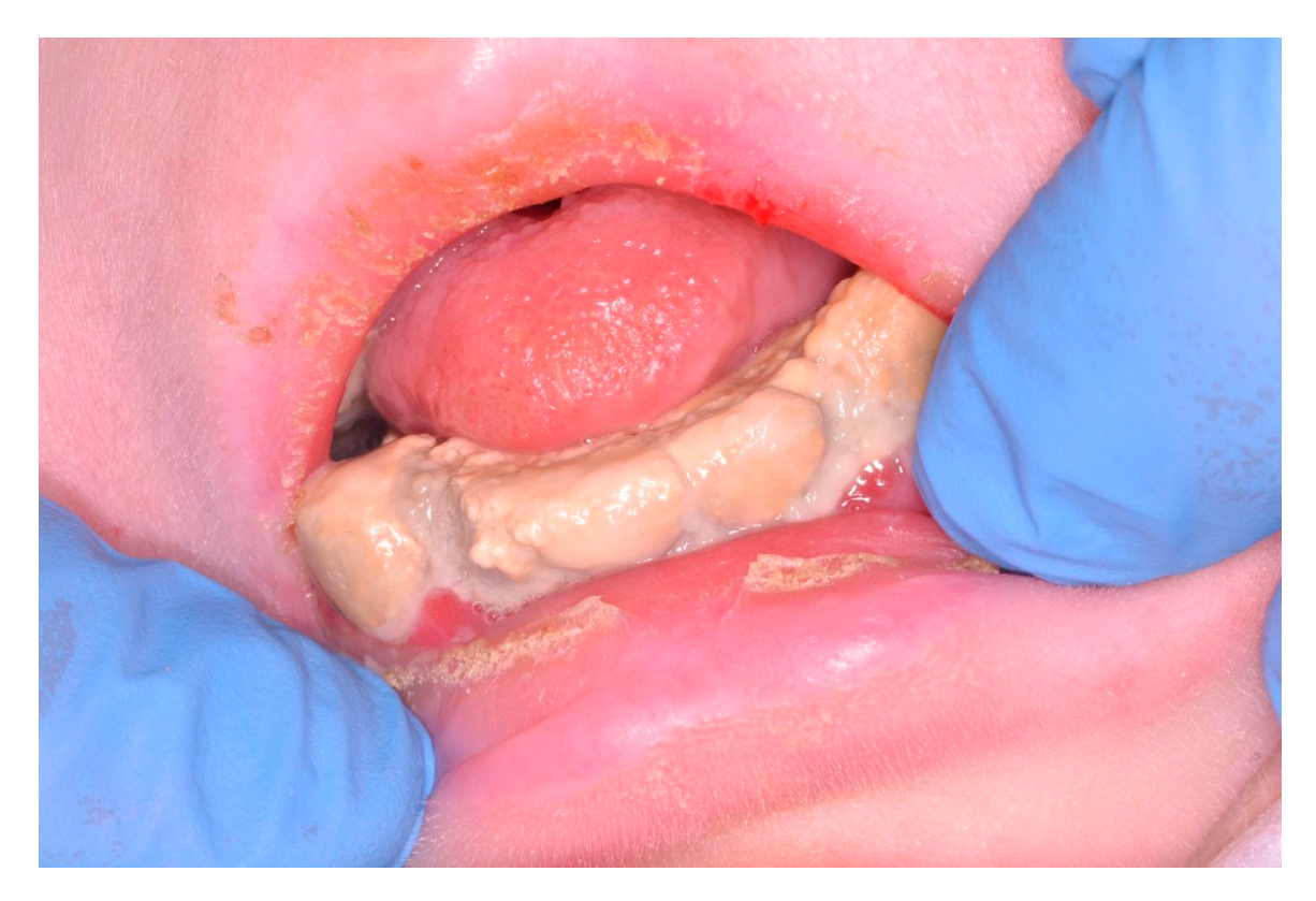
Figure 3. Calculus accumulation and periodontitis in a patient with special needs.