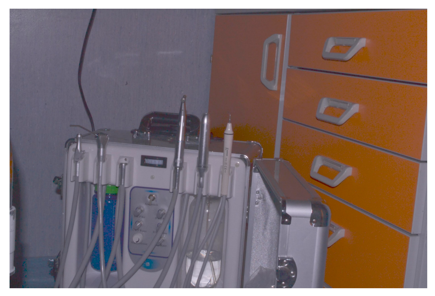
Figure 1. Portable dental unit (Best Dental Unit Ltd. 406).

Dental treatments were carried out at the bedside of nine SNPs using a portable dental unit (Best Dental Unit Ltd. 406, Guanzhou, China) equipped with ancillary devices (Figure 1).