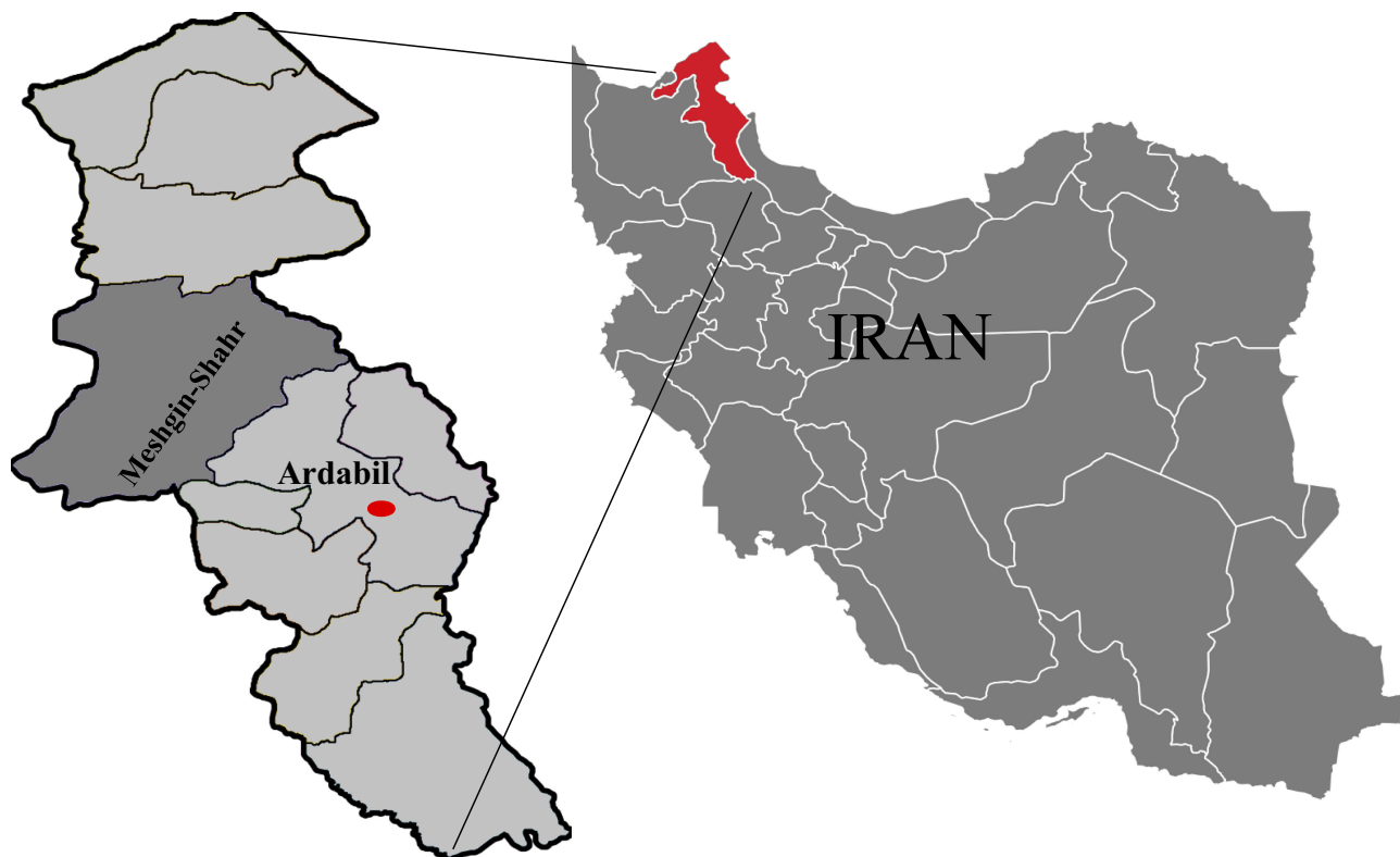
Figure 1 Map of Iran showing the geographical location of Ardabil Province and the study area, Meshgin-Shahr.

Genomic DNA from brain tissues of the rodents was extracted using the Qiagen DNA Minikit (Qiagen, Venlo, The Netherlands) according to the manufacturer's recommendations and stored at -20^{\circ}\text{C} until further use. Polymerase chain reaction (PCR) was performed to detect the T. gondii and N. caninum DNA using the specific primers targeted B1 and Nc5, respectively. 19,20 DNA extracted from RH strain tachyzoites, NC-1 strain tachyzoites and bidistilled water was used as the positive control for T. gondii and N. caninum and the negative control for PCR reactions,