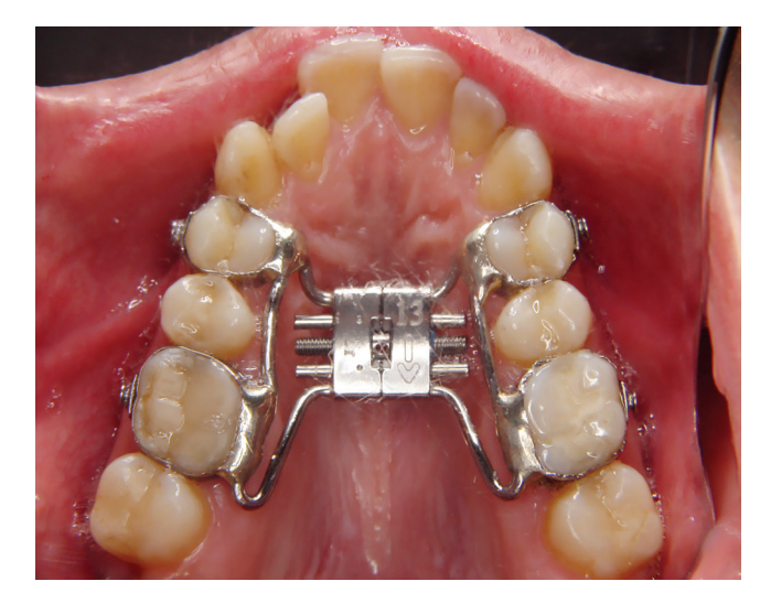
Figure 1 - Intraoral occlusal view showing the bonded expansion appliance.

» Clinical attachment level (CAL): was obtained by measuring the distance from the cemento-enamel junction (CEJ) to the gingival margin, and adding the measure of probing depth in the buccal area.