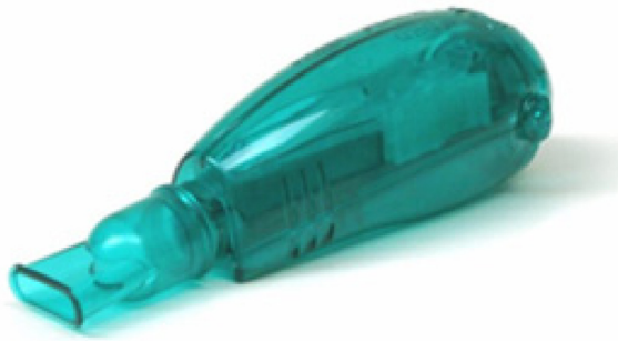
Figure 2 The acapella® physiotherapy device (Smiths Medical, St Paul, MN, USA).