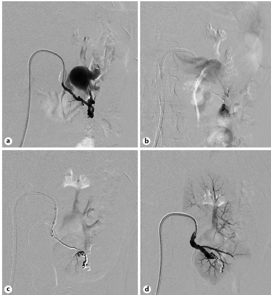
Fig. 2. a Left renal arteriography confirmed an AVF with aneurysmal dilatation and an enlarged draining vein. b Superselective catheterization before embolization. c Occlusion of an AVF and aneurysmal dilatation after embolization. d Confirmation of no additional detection of perfusion after the procedure.

Horikoshi et al.: A Case of Arteriovenous Fistula after Renal Biopsy in an IgA Nephropathy Patient with Macroscopic Hematuria