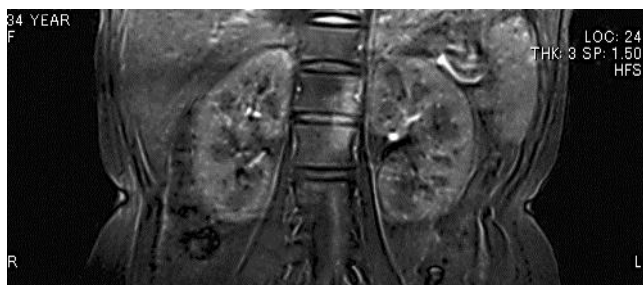
Fig. 3. Follow-up MRI taken 3 months after the intervention. No abnormalities, including the dilatation of the renal vein, can be seen.