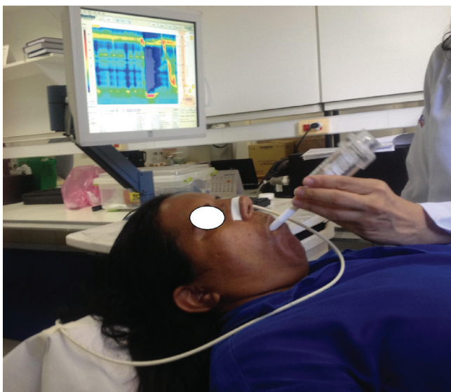
FIGURE 1 – Volunteer performing an inspiratory maneuver with the Threshold device

The respiratory maneuver has been previously described 2 . The volunteers stayed at the supine position without swallowing and the LES pressure was measured for 20 seconds before and during the maneuver. The maneuver consisted of fast and forced inhalation through a membrane valve (Threshold IMT, Philips Respironics, Andover, MA, USA) whose closing pressure (cmH 2 O) could be adjusted by a compression spring (Figure 1) 1 . All volunteers trained the maneuvers and undertook inhalations with 12, 24, and 48 cmH 2 O.