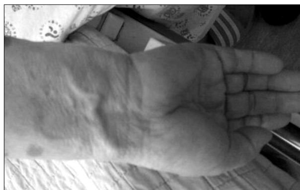
Fig. 1. Dilated superficial veins over right wrist.

the right forearm, which was very close to the previous puncture site for the diagnostic coronary angiography (Fig. 1).