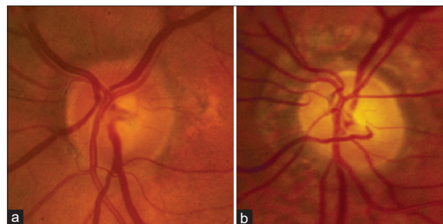
Figure 2: (a) shows optic disc in early PACG and (b) shows changes in optic disc in early POAG. Both patients had -5.0\text{ dB MD} on visual field. The optic disc of POAG eye shows larger beta zone and cup depth