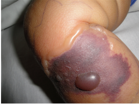
FIGURE 1: Local lesion with dark bluish black patch with well-circumscribed margins, surrounding erythema with edema, and blisters.

limbs representing small collections. Hyperemic changes within the muscles showing mild enhancement but no definite evidence of osteomyelitis (Figure 2). Incision and debridement of the lesions were performed with removal of the necrotic tissue. Drains were placed on both thighs which were removed after 5 days. Tissue culture also grew Pseudomonas aeruginosa which was sensitive to meropenem and ceftazidime. Histopathology of the tissue confirms the diagnosis of necrotizing fasciitis (Figure 3). i.v. meropenem was continued for three weeks along with daily wound care. The child was discharged subsequently in a stable state with planning of skin graft in the future.