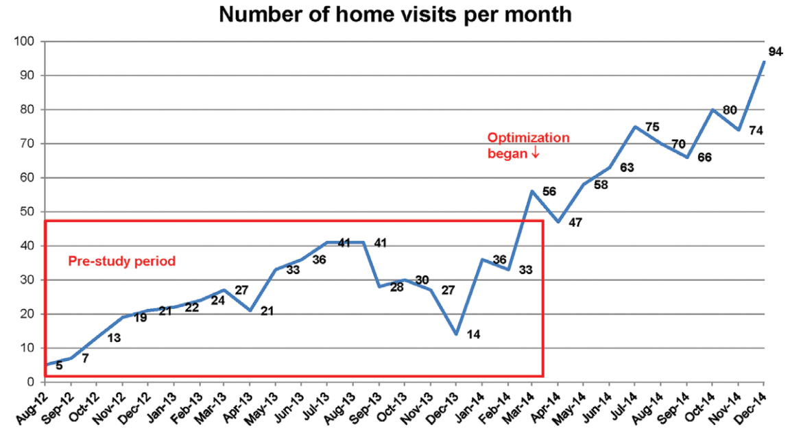
Fig. 2. Number of home visits per month.

each step of the process was performed efficiently by the most appropriate team member, which can also be sustained after the trial.