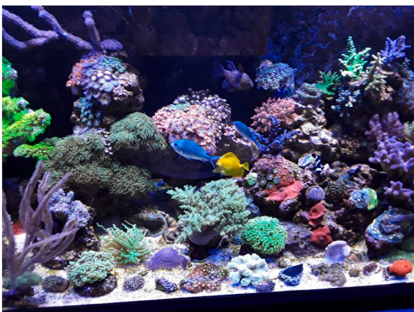
Fig. 2. Photograph of patient's aquarium that caused palytoxin exposure.

A 61-year-old male inadvertently touched his left eye while cleaning an aquarium (Fig. 2). Within 24 hours, pain, redness and visual blurring was noted. He presented to his family physician 48 hours later and was promptly referred to ophthalmology for an urgent same day consultation. The acute examination took place in an emergency department setting with inability to take ancillary imaging. Best corrected visual acuity was measured at 20/25 on the right eye and 20/200 on the left. A thick mucopurulent discharge was present with associated conjunctival edema. The corneal epithelium was denuded centrally and inferiorly with subepithelial infiltrates peripherally. The patient was treated with topical moxifloxacin (0.5%) drops 6x/day and prednisolone acetate (1%) 4x/day. He was seen for follow up 48 hours later with a significant improvement in discomfort. Vision had improved to 20/60 with resolution of conjunctival edema, partial corneal epithelialization and reduced erythema. Cultures for culture and sensitivity returned as normal. At four days post treatment, the cornea was fully epithelialized