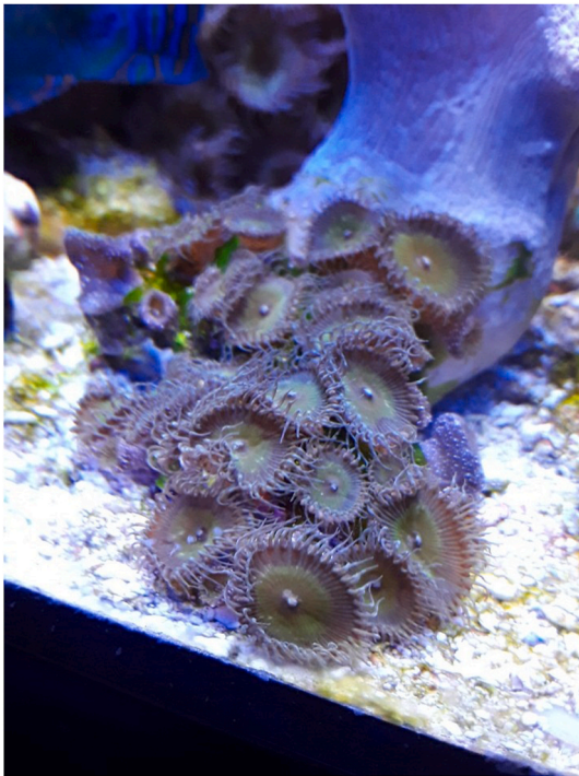
Fig. 1. Photograph of patient's zoonthid coral which can produce palytoxin.