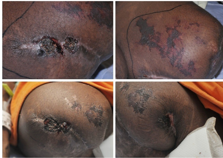
Figure 6 Recurrent purpuric and necrotic lesions on the amputation stumps with repeat use of cocaine.