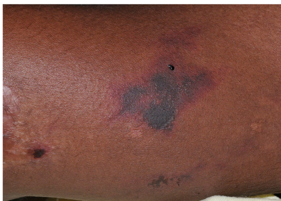
Figure 2 Purpuric patches on extremities.

Her urine toxicology screen was positive for cocaine, and gas chromatography–mass spectrometry (GCMS) was positive for levamisole. Punch biopsy of the skin from involved areas showed leukocytoclastic vasculitis with angiocentric infiltrates of mixed inflammatory cells and small vessel thrombosis with multiple fibrin thrombi in the lumen of the vessels (Figures 3 and 4).