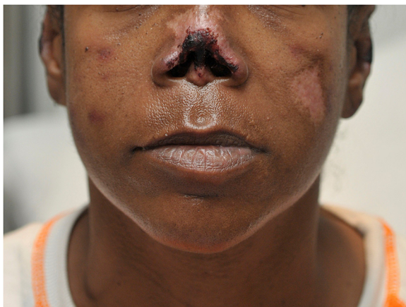
Figure 5 Necrotic lesions on the nose that eventually led to nasal septal destruction and self-amputation.

Two months later, the patient was readmitted with new painful necrotic lesions on the amputated stumps (Figure 6). She admitted to cocaine use three days prior to this admission. She was treated with intravenous methylprednisolone for three days followed by tapering doses of oral prednisone for seven days. Her pain and lesions improved significantly, and she was discharged home with a plan to follow up with the hospital's plastic surgery service for nose reconstruction.