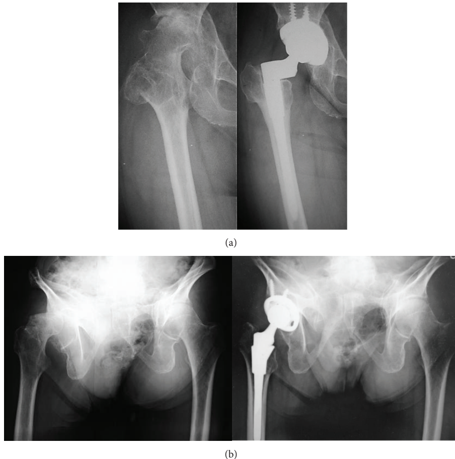
FIGURE 3: (a) 58-year-old female after pelvic and femoral osteotomy. Preoperative JOA was 52 points. Final follow-up (4Y) JOA was 74, stable fixation. (b) 84-year-old man with severe posterior pelvic tilt (50 degrees) 5 years after THA.

joints, and posterior pelvic tilt using the S-ROM-A system. The S-ROM-A prosthesis provides high stability of hip joints and reliable fixation for Asian patients.