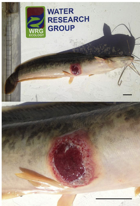
Fig. 2. Photographs of a lesion suspicious of epizootic ulcerative syndrome (EUS) on Clarias gariepinus from the Makuleke Wetlands.

single sharptooth catfish, Clarias gariepinus (Burchell, 1822) with a suspected EUS lesion (Fig. 2) was collected from the Nhlanguwe Pan (S 22° 22' 33.25" E 31° 12' 06.88"; Fig. 1) in the Limpopo River floodplain. The 2017 sampling trip was at the end of the summer high flow season with water levels already receding from the floodplains. Potentially, the single infected C. gariepinus could have been a remaining individual from a larger unrecorded outbreak during the preceding flooding period.