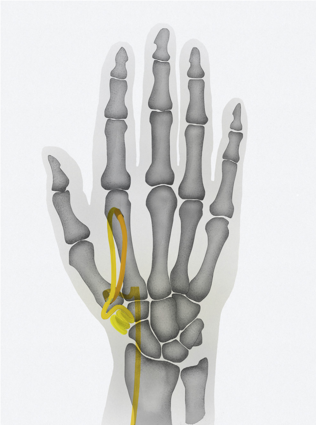
Figure 1. Surgical technique. After the trapeziectomy, a dorsovolar osseous tunnel is drilled at the base of the first metacarpal. Hereafter, a second tunnel is created in the dorsovolar direction in the second metacarpal neck, just proximal to the head of the second metacarpal. By this distal placement of the second tunnel, a V-shaped vector can be obtained with the suspension. A strip of the FCR tendon, with its insertion left intact, is used to suspend the first metacarpal to the second metacarpal in a V-shaped vector, because of the position of the second drillhole in the second metacarpal. Illustration by Marcus C.Y. Tong.