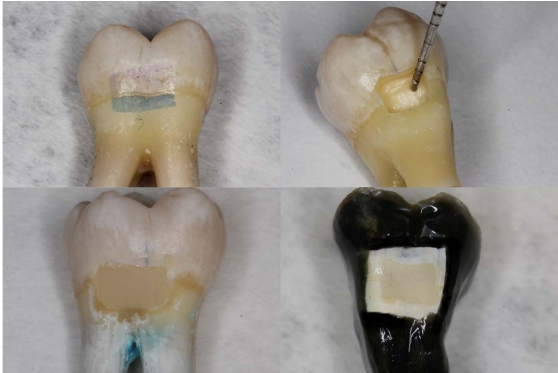
FIGURE 1. Specimen preparation (from top left to bottom right): 3 mm × 2 mm stamp centered at CEJ, 1.5 mm deep preparation (unbeveled pictured), filled with composite and finished, covered with an acid resistant varnish.

Preparations were hand drilled to 1.5 mm in depth using a 557 carbide bur. Half of the specimens ( n = 16 ) received a 0.5mm wide bevel surrounding the preparation. All preparations were restored using a resin composite (Filtek Supreme Ultra, 3M ESPE, St. Paul, MN, USA) placed with a bonding agent (Scotchbond Universal, 3M ESPE) in a total-etch mode. Specimens were etched (dentin and enamel) for 15 seconds with 37% phosphoric acid, rinsed for 10 seconds and lightly air-dried to leave dentin moist. One coat of bonding agent was applied and thoroughly scrubbed for 20 seconds and air evaporated for 10 seconds. The bonding agent was light polymerized with an Elipar S10 light curing unit (3M ESPE, 1100 mW/cm 2 ) for 10 seconds. The composite was placed in a single increment and light polymerized for 20 seconds with the same light curing unit. All specimens were finished with a carbide finishing bur (OS-2, Brasseler, Savannah, GA, USA) and polished using polishing discs (Sof-Lex, 3M ESPE) from rough to fine (Figure 1). Restoration margins were evaluated under magnification after finishing and polishing to ensure the absence of “flash” over the margin.