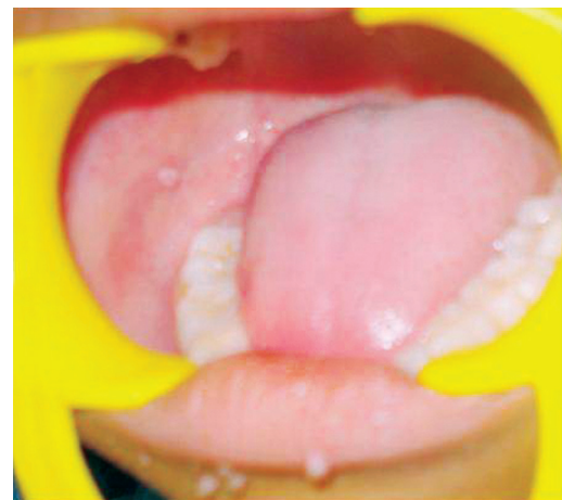
Fig. 4: Intraorally small flat lesion on right buccal mucosa

The patient underwent a complete blood investigation including Elisa test, which were within normal range. Excisional biopsy was performed with the patients parents consent (as he was a minor) from two different sites, i.e. dorsum of hand and intraorally from the right buccal mucosa. Histopathological examination revealed acanthosis with proliferative, hyperkeratotic, stratified squamous epithelium showing finger like projection and elongated rete pegs converging towards the center, producing cupping effect suggestive of verruca vulgaris. There were foci of vacuolated cells referred to as koilocytotic cells. Vertical tier of parakeratotic cells and foci of clumped keratohyalin granules were also seen (Figs 5A and B). Patient underwent a thorough oral prophylaxis only.