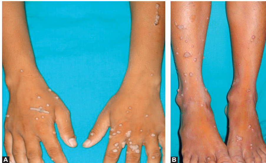
Figs 2A and B: Multiple grayish white lesions on the hands and legs

The patient underwent a complete blood investigation including Elisa test, which were within normal range. Excisional biopsy was performed with the patients parents consent (as he was a minor) from two different sites, i.e. dorsum of hand and intraorally from the right buccal mucosa. Histopathological examination revealed acanthosis with proliferative, hyperkeratotic, stratified squamous epithelium showing finger like projection and elongated rete pegs converging towards the center, producing cupping effect suggestive of verruca vulgaris. There were foci of vacuolated cells referred to as koilocytotic cells. Vertical tier of parakeratotic cells and foci of clumped keratohyalin granules were also seen (Figs 5A and B). Patient underwent a thorough oral prophylaxis only.