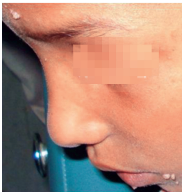
Fig. 1: A 9-year-old boy presenting with papillary growths on the forehead, inner canthus of eye, left angle of mouth and on vermilion border of lip

A 9-year-old boy reported to the Department of Oral Medicine, Radiology and Diagnosis with multiple, small, whitish growth on his legs, hands, fingers and face (Fig. 1). The first symptom of this appeared 2 year ago. Lesions were asymptomatic except for slight occasional itching. Similar type of lesion also had been noticed in his elder brother and peers, which regressed spontaneously without any treatment. Systemic review was noncontributory. Patient neither suffer from any long-term illness in the past nor was on any medications. On extraoral examination, numerous keratotic, well-defined whitish colored, papules varying in size from 2 to 4 mm were found on dorsum of hand, feet, face, chin and angle of mandible (Figs 1 to 2B). On left hand they were found in groups of more than 20 in number. Some of the lesions on left hand were in a linear fashion and exhibited Koebner phenomenon. Mild discharge of blood was noticed on scraping the lesion (Fig. 3).