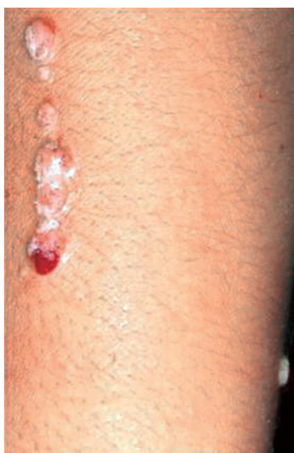
Fig. 3: Coalesced linear occurring lesions showing bleeding