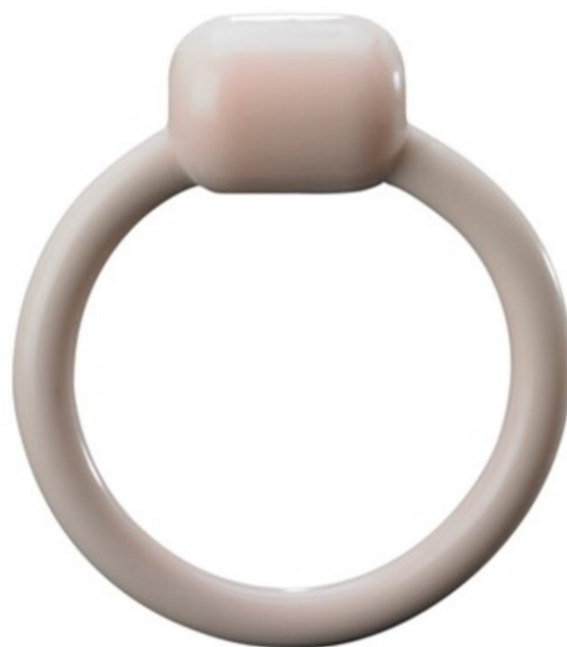
Figure 1 Picture of a Millex flexible incontinence ring pessary (Millex pessaries, CooperSurgical, Inc).

Sixteen women (80%) agreed to participate in individual, semi-structured interviews. However, during the interview of one woman it turned out that she had less than 2 weeks of experience with wearing a pessary and she was therefore excluded prior to analysis. The reasons why the four