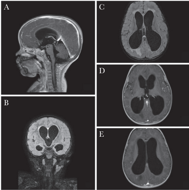
Figure 1. Magnetic resonance image of a 14-month-old child with postmeningitic hydrocephalus. A, Sagittal gadolinium-enhanced T1 images showing communicated, enlarged lateral third and fourth ventricles. B, Coronal fluid-attenuated inversion recovery (FLAIR) images showing enlargement of third and lateral ventricles. C, Axial FLAIR images showing enlargement of lateral ventricles with periventricular hypersignal. D, Axial gadolinium-enhanced T1 images showing leptomeningeal enhancement. E, Axial gadolinium-enhanced T1 images showing enlargement of lateral ventricles.

methylprednisolone was switched for oral prednisone at 1 mg/kg/d after 48 hours and continued for 14 days in total. Repeated large-volume lumbar punctures (LPs) were performed. Opening pressure at LP was normal, CSF was clear, and eosinophil count and protein level in CSF gradually decreased (Table 1, Figure 2). Significant clinical improvements were noted over time. After the first large-volume LP, stability while sitting improved and the right hemiparesis gradually disappeared. After 1 week of treatment, the child completely regained function of the paretic limb and was able to use both hands equally. His language skills improved after