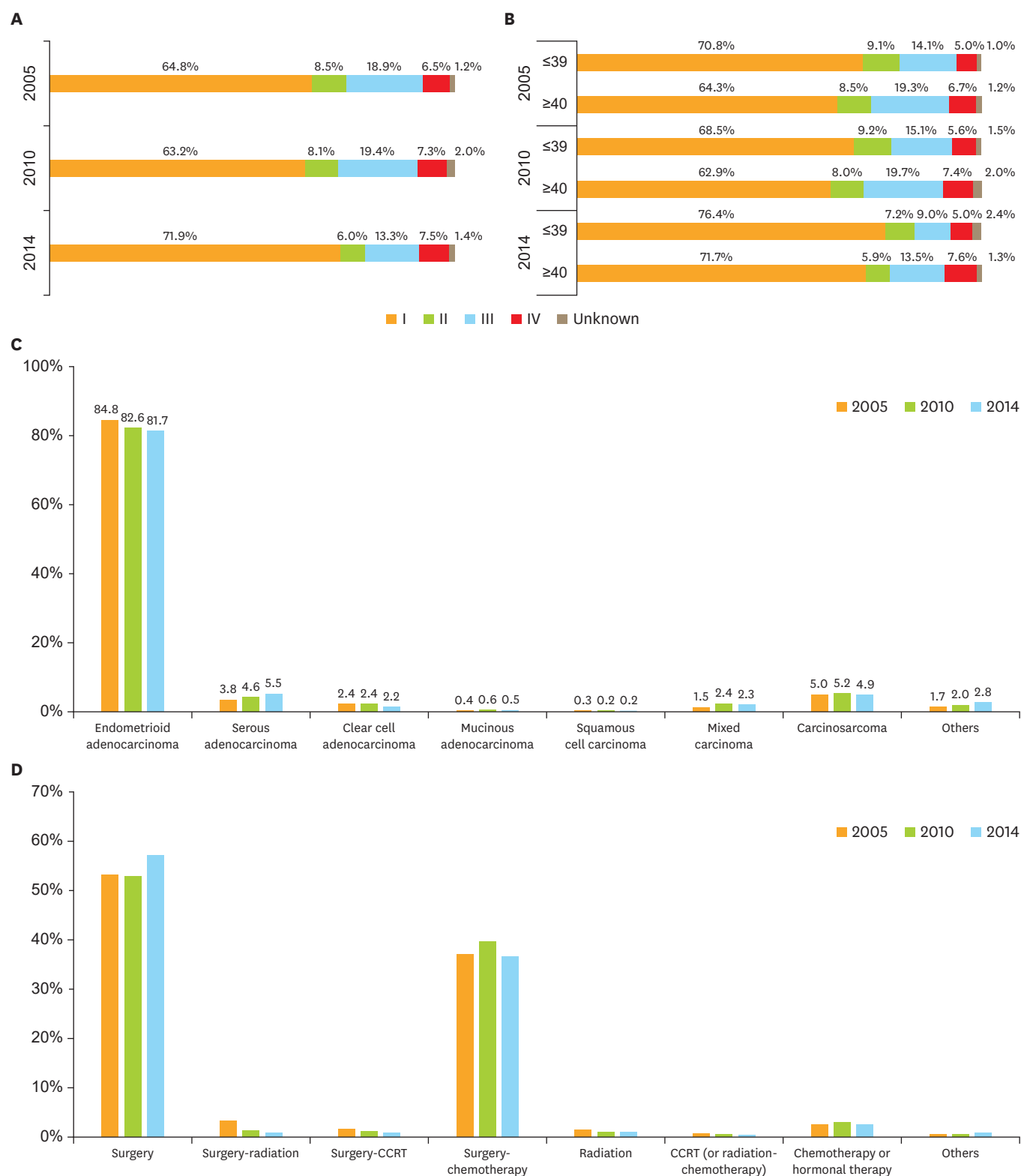
Fig. 3. Characteristics of endometrial cancer. (A) Distribution of post-surgical stages in endometrial cancer. (B) Distribution of post-surgical stages in both younger and older patients with endometrial cancer. (C) Distribution of histological types in endometrial cancer. (D) Distribution of treatment methods in endometrial cancer.