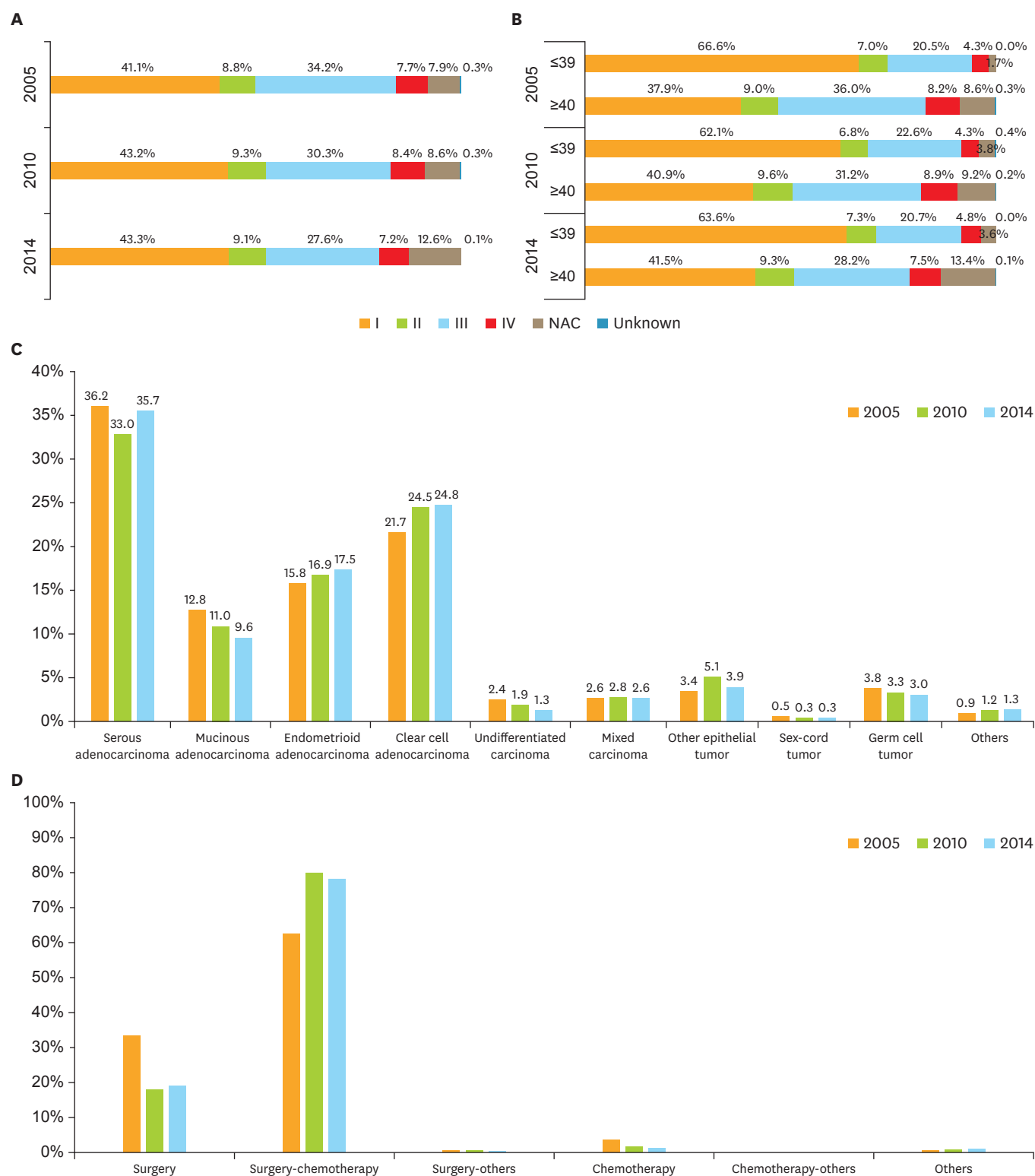
Fig. 4. Characteristics of ovarian malignant tumor. (A) Distribution of post-surgical stages in ovarian malignant tumor. (B) Distribution of post-surgical stages in younger and older patients with ovarian malignant cancer. (C) Distribution of histological types in ovarian malignant cancer. (D) Distribution of treatment methods in ovarian malignant cancer.