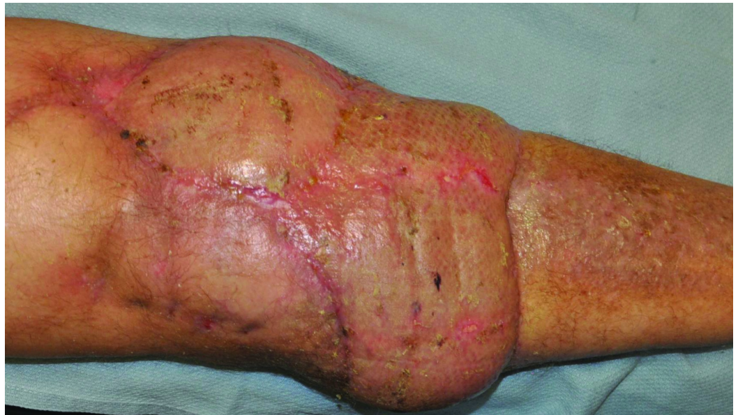
FIGURE 2: Post-operative photograph of the well-healed right knee

Eight weeks after, the wound bed was debrided and a vertical rectus abdominis free flap was transferred to the right knee, where the vascular pedicle was anastomosed to the posterior tibial artery in a side-to-end manner and two posterior tibial veins with venous couplers. A Cook-Swartz implantable Doppler was placed around the deeper of the two veins. A meshed split-thickness skin graft was fixed in place. Tissue specimens were positive for vancomycin-resistant Enterococcus and Candida tropicalis . Post-operative course was otherwise unremarkable. Eight months later, a TKA and extensor mechanism repair with an Achilles tendon allograft was performed with the aid of the plastic surgeon for flap elevation and complex closure of the wound. Eleven months after his initial presentation, the patient was satisfied with the outcome as he had regained his independence and could drive. His right knee demonstrated a passive range of motion from 0°-50° and active range of motion from 20°-60°. The incisions and donor graft site were well healed with no evidence of infection (Figure 2).