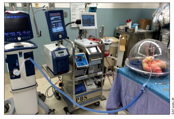
Figure 2: Ex-vivo lung perfusion system Human lungs under the dome are ventilated and perfused.