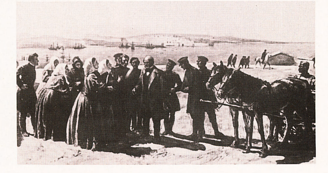
Fig 4. Pirogov's departure from Sebastopol. Saying goodbye to the Sisters of the Community of the Cross. Painting by P Buchkin. Pirogov House Museum. Vinnitza (town), Ukraine.

Journal of the Royal College of Physicians of London Vol. 29 No. 1 January/February 1995