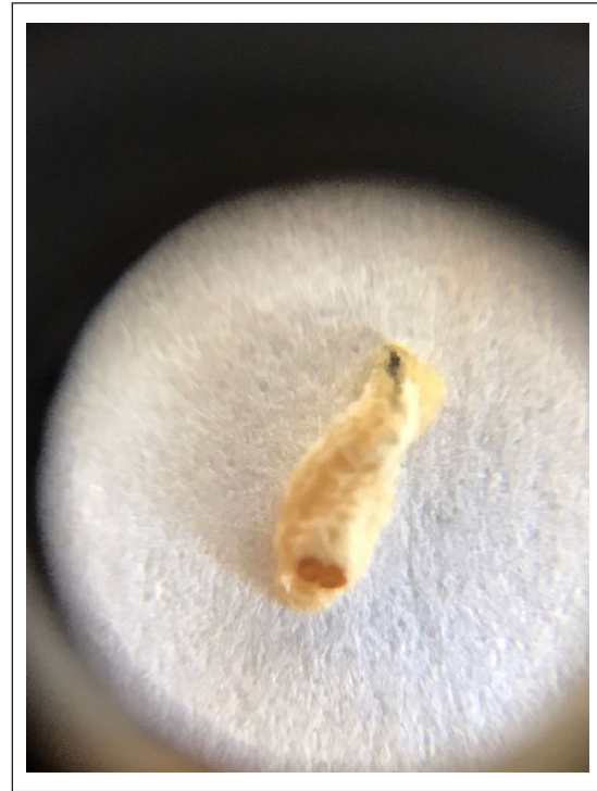
Figure 1. Oestrus ovis as a cause of nasal myiasis.

Commonly, the infestation lasts 2 weeks and causes moderate-to-severe nasal discomfort with obstruction, rhinorrhoea and a burning sensation. Allergic reaction due to nasal O. ovis infestation requiring hospitalization is known to be an unusual presentation. 11 In our case, severe allergic reaction accompanied with asthma-like symptoms occurred and aggressive treatment was required.