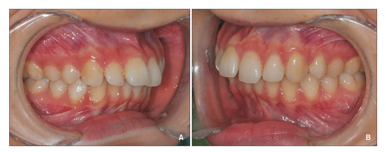
Figure 1. A representative example of clinical presentation (Angle Class II) in the experimental group before orthodontic treatment. A, Right side; B, left side.

The study sample consisted of 16 healthy subjects (mean age 25.7 \pm 4.3 years) who required the extraction