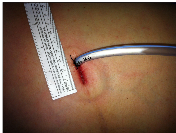
Fig. 2. Postoperative surgical wound.

tomy, the resected lobe was removed using a protective bag in all cases. Routine systematic mediastinal and hilar lymph node dissection was performed with a harmonic scalpel in all cases. The lymph nodes, including perinodal tissue, were removed. In all of the cases, the lower paratracheal (no. 4), subaortic (no. 5), paraaortic (no. 6), subcarinal (no. 7), lower parasophageal (no. 8), inferior pulmonary ligament (no. 9), hilar (no. 10), interlobar (no. 11), and lobar (no. 12) nodes were removed. At the end of the procedure, a 24-French chest tube was placed in the posterior part of the single incision (Fig. 2).