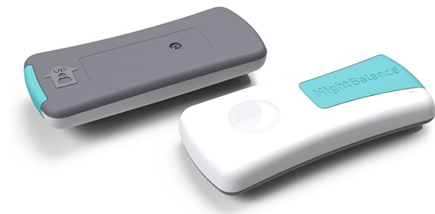
Fig. 1 Sleep position trainer

Secondary outcomes were the severity of snoring and satisfaction using the SPT. To evaluate the severity of snoring, a numeric visual analogue scale (VAS) containing a score between 1 (no snoring) and 10 (severe snoring) was filled out by the bed partners, at baseline and after 6 week of using the SPT. The study subjects were asked a dichotomous question (containing yes or no) about satisfaction using the SPT for a period of 6 weeks. Furthermore, according to the study by Lee et al. response profiles were determined; VAS \leq 3 post-treatment was defined as 'major response' and post-treatment VAS \leq 5 plus SOS \geq 60 defined as 'fine response' [31].