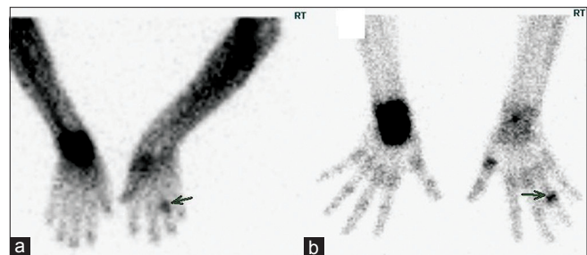
Figure 2: Anterior and posterior blood pool images (a) and delayed images (b) demonstrates increased blood pool concentration and uptake in right 4 th proximal interphalangeal joint consistent with synovitis (arrows)