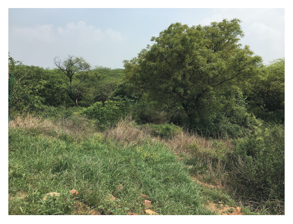
FIGURE 1 People say "it's everywhere" and it "grows back." An image from Sanjay Van (Sanjay forest) in the southern part of the Delhi Ridge.