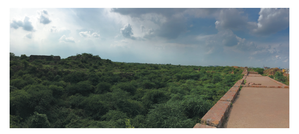
FIGURE 2 Tughlaqabad fort where the Delhi sultanate was founded in the 1320s, with vilayati kikar skyline edging the horizon, as of July 2018.

of dark green meshes with the dark skies of the monsoon. To think with Kirksey's (2015, 1) work on Emergent Ecologies—"When a forest is clear-cut by loggers or destroyed by a volcanic eruption, emergent plants are the first to sprout. Nascent associations are able to exploit faults and fissures within established assemblages. They contain the promise of supplanting deeply rooted structures." The category of the existing monsoon forest is what is arguably supplanted by this emergent assemblage. What I want to pose however is the possibility of a monsoonal assemblage not just to be a site of displacement but of methodological reconceptualization. In thinking with the stories Kirsky writes about, I observe an openness to the dynamics of liveliness. Registers of separation between sky, thicket, geology and the time of the monsoon are broken down as showers allow geologies to hold waters to allow thickets to flourish. The assemblage unfurls.