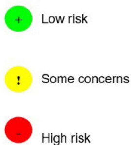
Figure 3 Assessment of the quality of the included case reports.

when combined with oral TXA (250 mg/TID), conferred a superior safety profile with less adverse reaction as was evident in a case report of 12 weeks duration conducted in Korea on a female subject with PIH following Intense Pulsed Light (IPL) therapy. 23