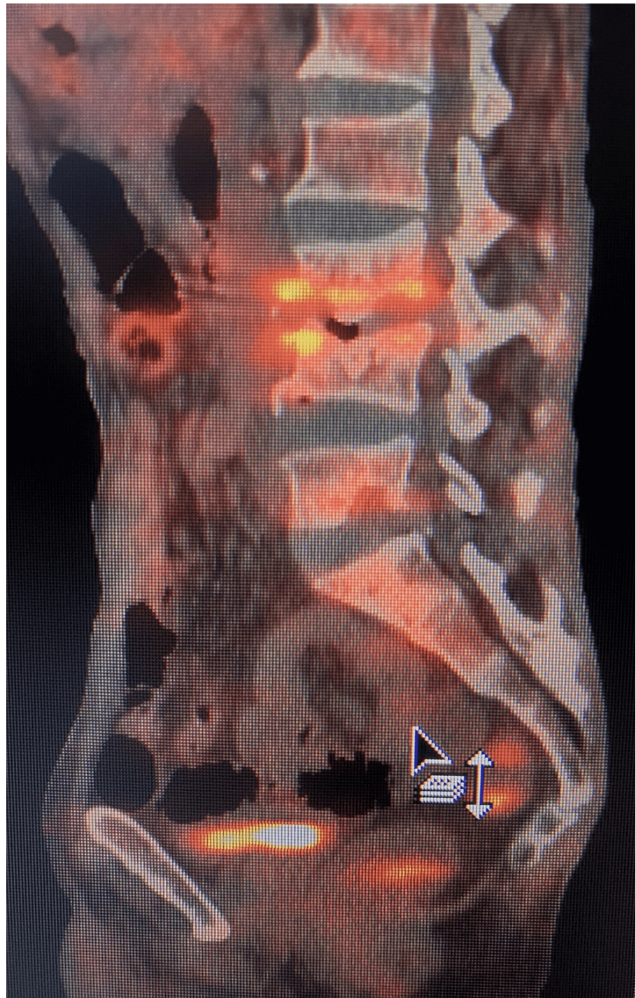
FIGURE 2: FDG PET/CT of the spine

FDG PET/CT showing degenerative changes of the spine along with the collapse of L3 vertebra, end plate changes with the erosion of superior end plate of L4 and inferior end plate of L3 vertebra Increased FDG uptake was seen in L3 - L4 intervertebral disc (SUVmax = 6.3) suggestive of residual disease.