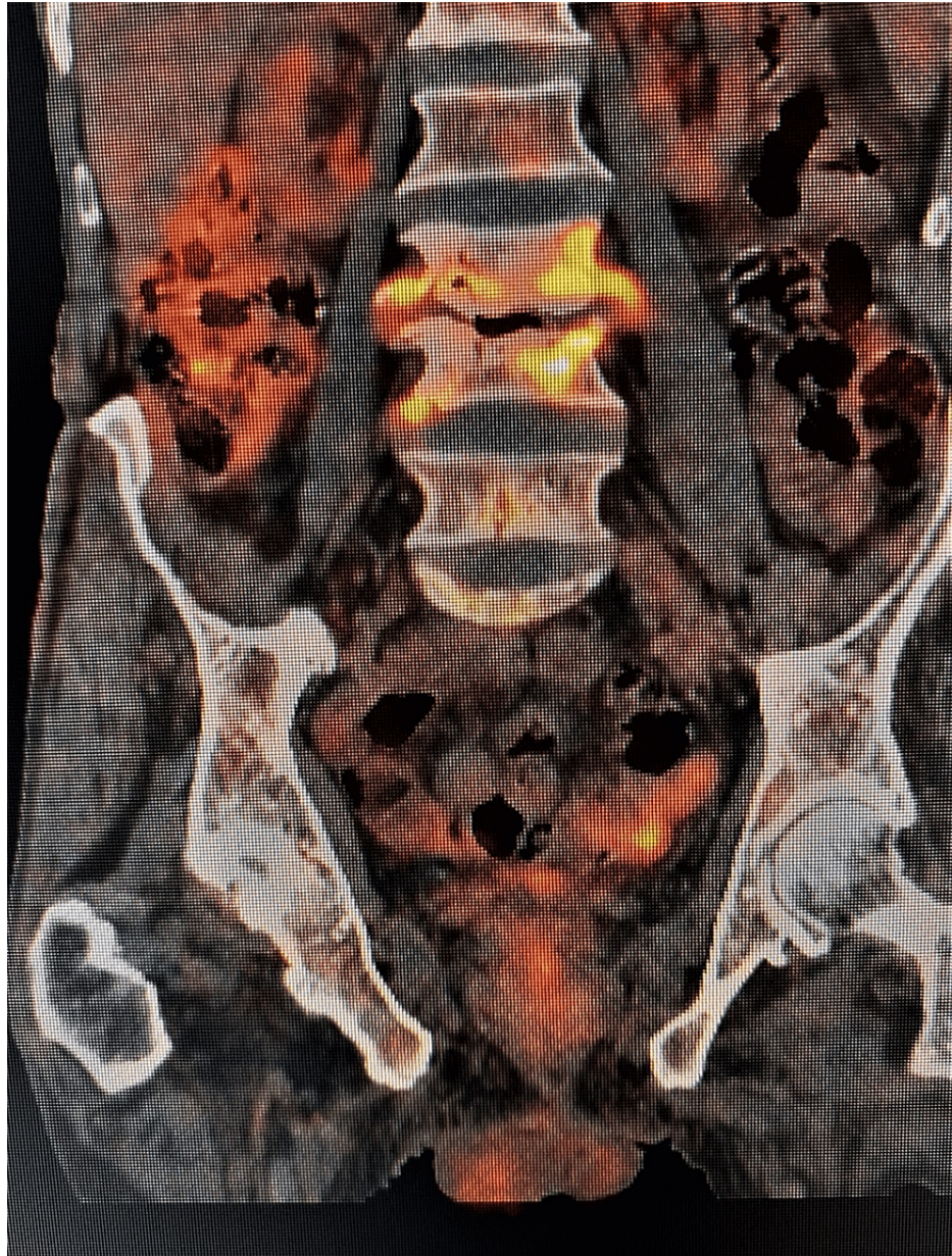
FIGURE 3: FDG PET/CT of the same patient as above after six months showing a decrease in FDG uptake in L3 - L4 intervertebral disc (SUVmax = 4.1)

FDG - fluorodeoxyglucose, PET - positron emission tomography, SUVmax - maximum standardized uptake value