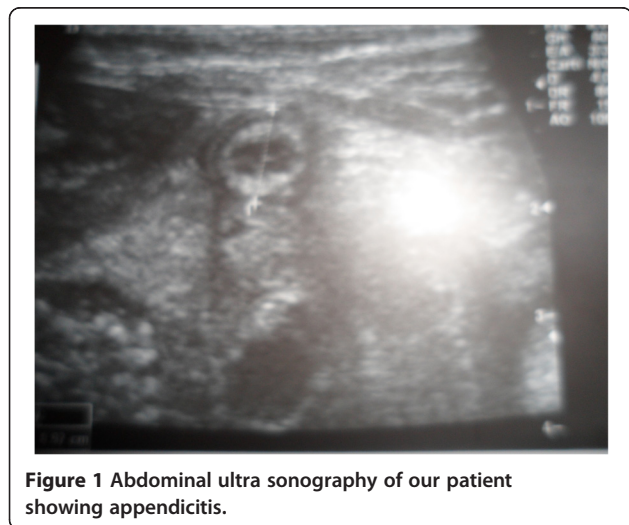
Figure 1 Abdominal ultra sonography of our patient showing appendicitis.

every blunt abdominal trauma case [5-7]. According to Ramsook [3], a sudden increase in intra abdominal pressure may lead to an increased intra ceecal pressure followed by a rapid distention of the appendix which may result in appendicitis.