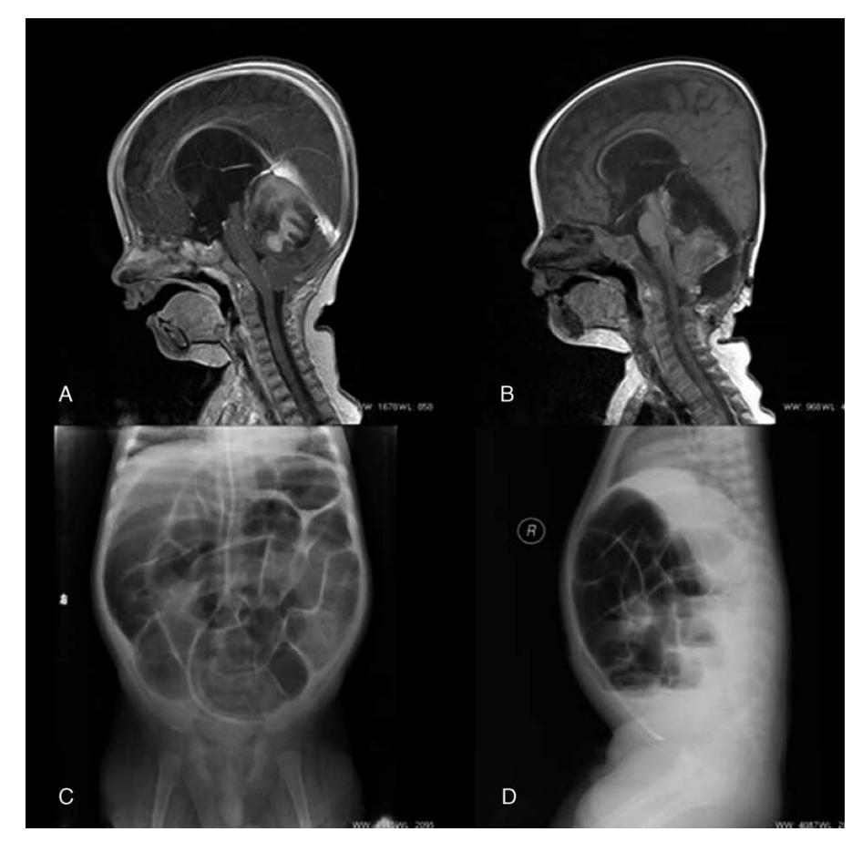
FIGURE 1. Case 1. (A) Preoperative sagittal contrast-enhanced T1-weighted magnetic resonance images showed a heterogeneously enhancing mass centered in the posterior fossa with compression of the fourth ventricle and obstructive hydrocephalus. (B) Postoperative sagittal T1-weighted magnetic resonance imaging confirmed gross total resection of the tumor. (C and D) Anteroposterior and lateral plain abdominal radiography showed complete intestinal obstruction.

A 6-year-old boy presented to our emergency department with a 2-week history of headaches and vomiting. Computed tomography (CT) of the head showed the aqueduct of the midbrain was compressed, the supratentorial ventricles were dilated (Figure 2A and B), and there was a mixed density 4.0 (transverse) \times 3.2 (anteroposterior) \times 5.1 (superoinferior) cm mass centered in the pineal region with effacement of the third ventricle and obstructive hydrocephalus (Figure 2C). MRI confirmed the presence of an inhomogeneous tumor occupying