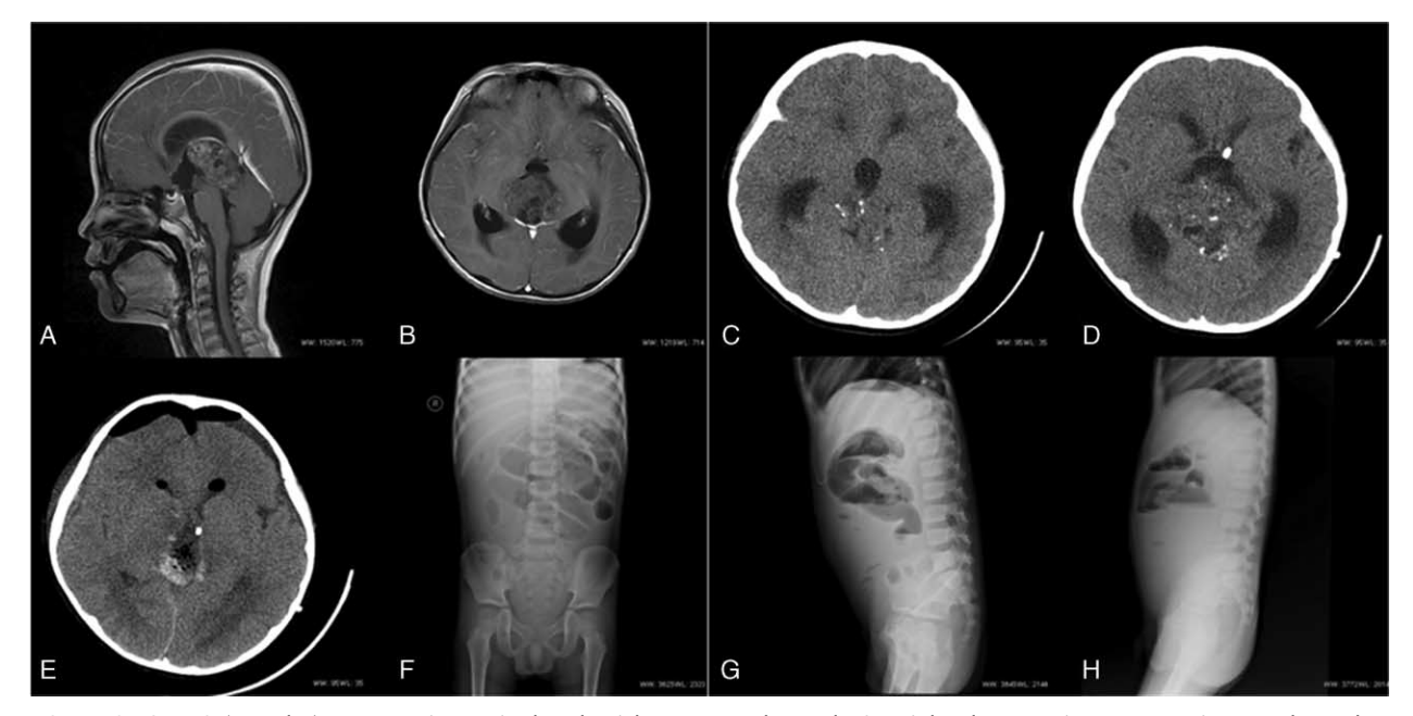
FIGURE 2. Case 2 (A and B) Preoperative sagittal and axial contrast-enhanced T1-weighted magnetic resonance images showed an intense but slightly inhomogeneous enhancement of the tumor occupying the posterior third ventricle and spreading though the tentorium. The aqueduct of midbrain was compressed, and the supratentorial ventricles dilated. (C) Preoperative noncontrast computed tomography (CT) showed an isodense tumor in the pineal region with calcifications. (D) Two weeks after the first course of chemotherapy, the patient suddenly fell into coma and the CT scan demonstrated obvious enlargement of the tumor. Shunted hydrocephalus was noted. (E) Postoperative CT showed gross total resection of the tumor. (F and G) Anteroposterior and lateral plain abdominal radiography showed partial intestinal obstruction 17 days after tumor resection. (H) Plain abdominal radiography showed complete intestinal obstruction 15 hours after prior films.

the posterior third ventricle, which had spread through the tentorium. Serum \alpha -fetoprotein was elevated (555 IU/L), and \beta -human chorionic gonadotropin was normal. This patient was diagnosed with a primary nongerminomatous malignant germ cell tumor. Endoscopic third ventriculostomy (ETV) was considered, but not performed because of concerns of bleeding from the tumor and restriction of the operating space because of the large size of the lesion. Thus, a VP shunt was placed. The shunt placed and the placement procedure was the same as described for case 1, and the placement was performed by the same attending neurosurgeon. CSF cytology was negative at initial shunt placement. Following shunt placement, chemotherapy (carboplatin + etoposide + bleomycin) was administered.