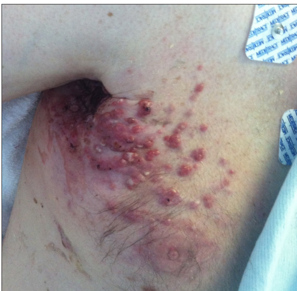
Figure 1. Skin rash on presentation.

A forty-nine-year-old man with an initially unknown past medical history (except recent treatment for herpes zoster) was brought to the emergency department for a right thoracic rash and skin lesions.