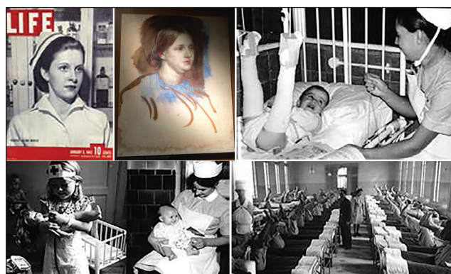
Figure 2: Pictures from the Florence Nightingale Museum in London. These are samples of pictures that supported my historical research.