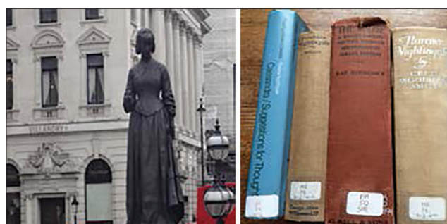
Figure 3: Selected artifacts and references.

but Goleman's model was selected because it takes into account both learned skills and innate traits, including control of one's impulses, self-motivation, empathy and social competence in interpersonal relationships. [12]