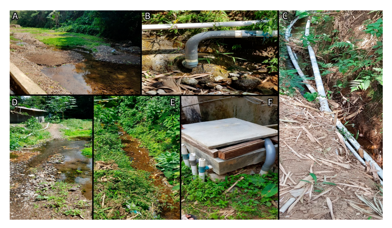
Figure 3. Flow of water in Losari. ( A , D , E )—Neighboring environment of groundwater spring. ( B , C )—Pipes from spring to holding tank. ( F )—Water holding tank.