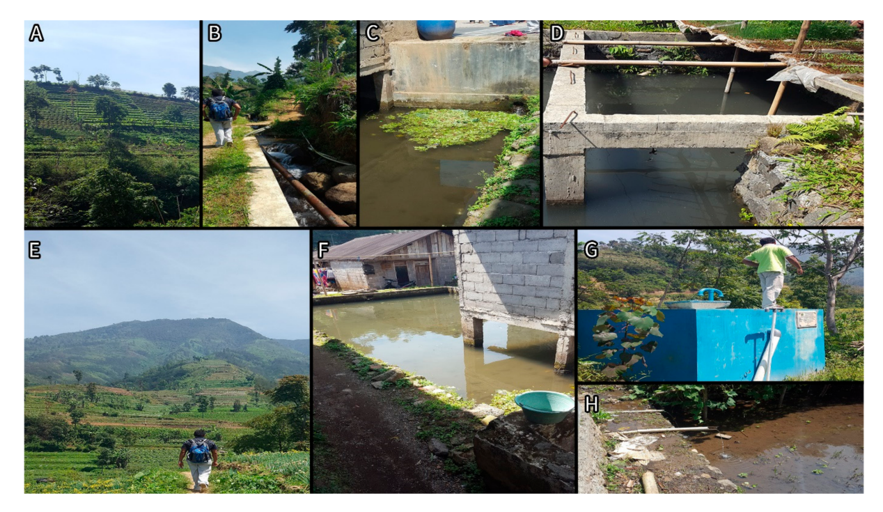
Figure 4. Flow of water in Topengan. ( A , E )—Surrounding environment of Topengan village. ( B )—Pipes from the spring to the holding tank. ( C )—Concrete outflow channel to the fishpond. ( D )—Crops grown above the fishpond. ( F , H )—Fishpond. ( G )—Water holding tank.

The estimated nitrate intake from drinking water was as high as 96.16 mg/day for adult males and pregnant females when calculated at CP_{EXP95} in Losari, and as low as 5.07 mg/day for infants when calculated at CP_{EXP50} in Topengan (Table 2). When the estimated nitrate intakes were divided by the estimated average weight for each demographic group, infants had higher weight-adjusted intakes than adults, reaching 6.03 mg/kg/day