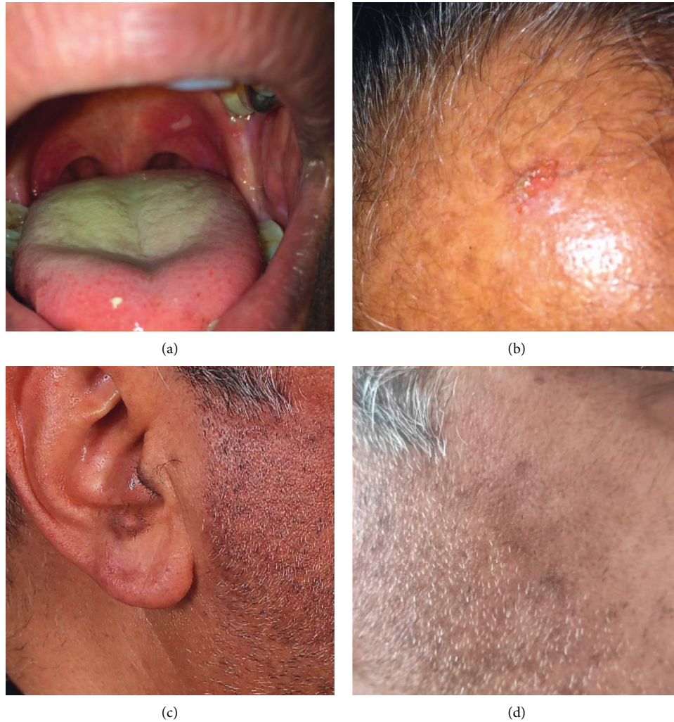
FIGURE 1: Oral mucosal lesions (a) and scalp erosion (b) due to pemphigus and hyperpigmented macules on ear (c) and cheek (d) due to lichen planus pigmentosus following COVID-19 vaccination.

also noticed multiple well-defined grey-brown hyperpigmented macules on the ears, cheeks, and chin (Figures 1(c) and 1(d)). He denied exposure to any topical medications or potential for personal care product/occupational contact dermatitis. Since the nature of this pigmentation was unclear, we performed a punch biopsy of a representative chin lesion which showed typical findings of lichen planus (LP) pigmentosus (Figure 2).