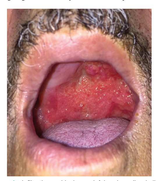
Figure 1 - Infiltrative oral lesion, painful and smelly, similar to moriform stomatitis, with an irregular hyperemic surface located on the palate.

The patient sought for care on September 8, 2016 at the outpatient clinic of Systemic Mycoses of the Sao Jose Hospital of Infectious Diseases, in Fortaleza, Ceara State, complaining of an oral inflammation that had been upsetting him during the past three years. Fever or respiratory symptoms were not reported. The infiltrative oral lesion was located on the palate (Figure 1). In addition, an ulcerative lesion was found on the skin and right nasal mucosa (Figure 2). Hypophonetic cardiac sounds and reduced vesicular murmurs in both lungs were also found. The abdominal examination was normal, and cervical lymph node enlargement was not observed. The patient reported cigarette consumption of 40 packs/year for 40 years but had stopped smoking that past year. After undergoing a chest X-ray, nodules with predominantly