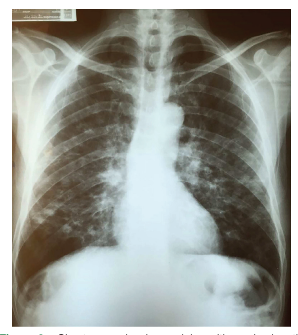
Figure 3 - Chest x-ray showing nodules with predominantly central distribution affecting both lungs, some with signs of cavitation and bilateral perihilar reticular infiltrate.

central distribution were observed affecting both lungs, some showing signs of cavitation and bilateral perihilar reticular infiltrate (Figure 3).