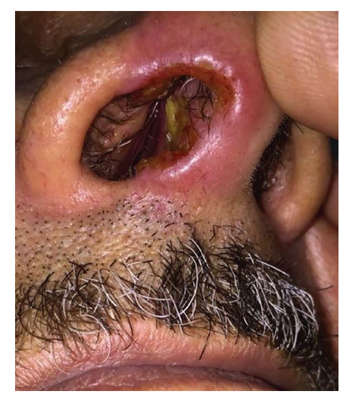
Figure 2 - Ulcerative lesion in the right nasal mucosa and skin.

central distribution were observed affecting both lungs, some showing signs of cavitation and bilateral perihilar reticular infiltrate (Figure 3).