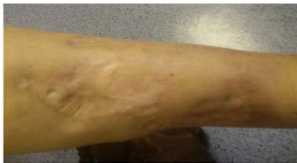
Figure 3 Skin manifestation of calciophylaxis. Left distal leg taken 4 months after the initiation of continuous ambulatory peritoneal dialysis.

Note: Note the Tenckhoff catheter in the abdominal cavity; the X-ray was taken the day after catheter insertion.