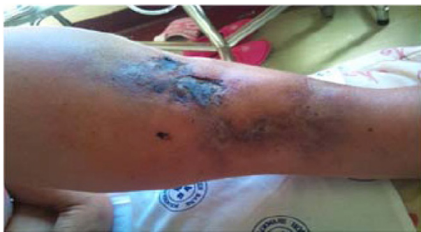
Figure 1 Skin manifestation of calciphylaxis. Left distal leg at the first predialysis visit.

At the first renal clinic visit, she was comfortable and well oriented in place, time, and person. However, she was severely pale, her blood pressure was normal, and her body mass index was 33 kg/m 2 . There was no dyspnea, jaundice, or cyanosis. Neck vessels appeared normal and the hepatojugular reflux was normal too. Cardiovascular examination revealed a hyperkinetic nonsustained apex beat at the fifth intercostal space on the mid-clavicular line. No murmurs were heard. Abdominal palpation yielded palpable bilateral flank masses with ballottement. In the distal left half of her leg, a well-demarcated ulcer over the medial aspect was noted. The center of the lesion was very dark in color and dry. There was another extensive ulcerative area below and more distal to the previous lesion, toward the medial position, approaching the anterior dorsum of the foot (Figure 1). On touch, there was tenderness, increased local temperature, and induration. A light bluish macular lesion with ill-defined borders and a warm and tender indurated area about 5 cm wide with intact skin was found above the right knee as well.