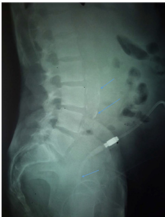
Figure 2 Linear calcification of the descending aorta.

Abbreviations: Pi, phosphates; PTH, parathyroid hormone.