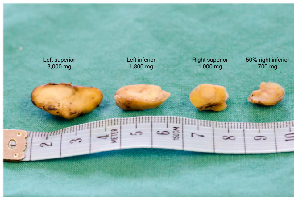
Figure 6 Patient's parathyroid glands. Note: Normal gland weighs <50 mg.

In our case, the use of cinacalcet and CAPD appeared to have halted the disease, despite the fact that PTH, Pi, and Ca were not sufficiently corrected. Although creatinine levels did not change significantly after the initiation of dialysis, a marked clinical improvement, healing of skin ulcers, and the patient's perception of well-being prompted the pursuit of CAPD. So far, she has survived 40 months, benefiting from all the advantages of peritoneal dialysis. In a retrospective study carried out by Weenig et al, 16 64 patients were evaluated. An estimated survival rate of 45.8% was reported in the first year, but for those who received surgical debridement it was 61.6%