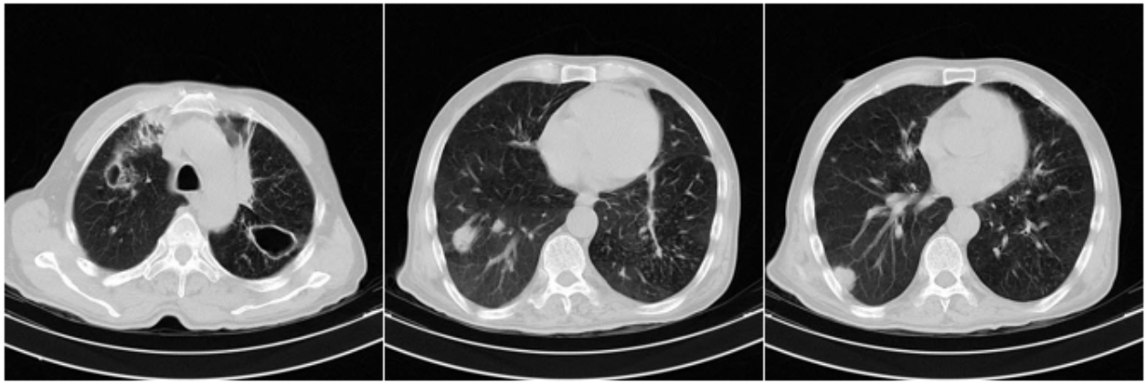
Figure 2. Chest computed tomography scan of our patient with positive bronchoalveolar lavage smear for tuberculosis and Cryptococcus neoformans show cavitations in both upper lobes along with bilateral multiple nodules