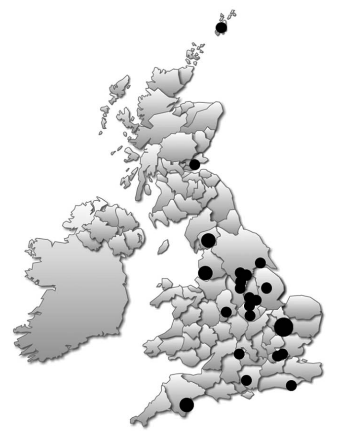
Fig. 2. Map showing the centers in the United Kingdom that took part in the Delphi review.

tinnitus. Senior audiologists tend to have more specialist knowledge and more experience than audiologists at a lower grade of employment. Both groups are represented here. In the United Kingdom, independent sector audiologists and hearing aid dispensers rarely specialize in tinnitus, and this perhaps explains why they were less represented in the panel.