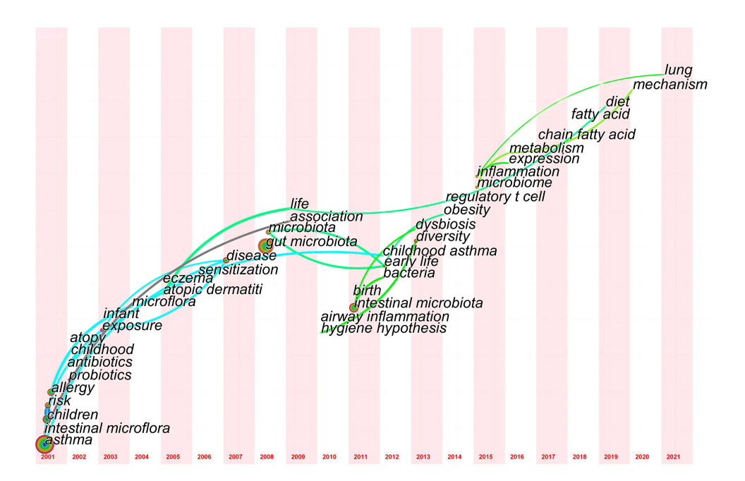
Figure 5 Keyword development stages on intestinal flora and asthma.

can carry out extended research in cross-cluster subject areas to serve as a new entry point for current research. By 2016, short-chain fatty acids and other keywords appear successively.