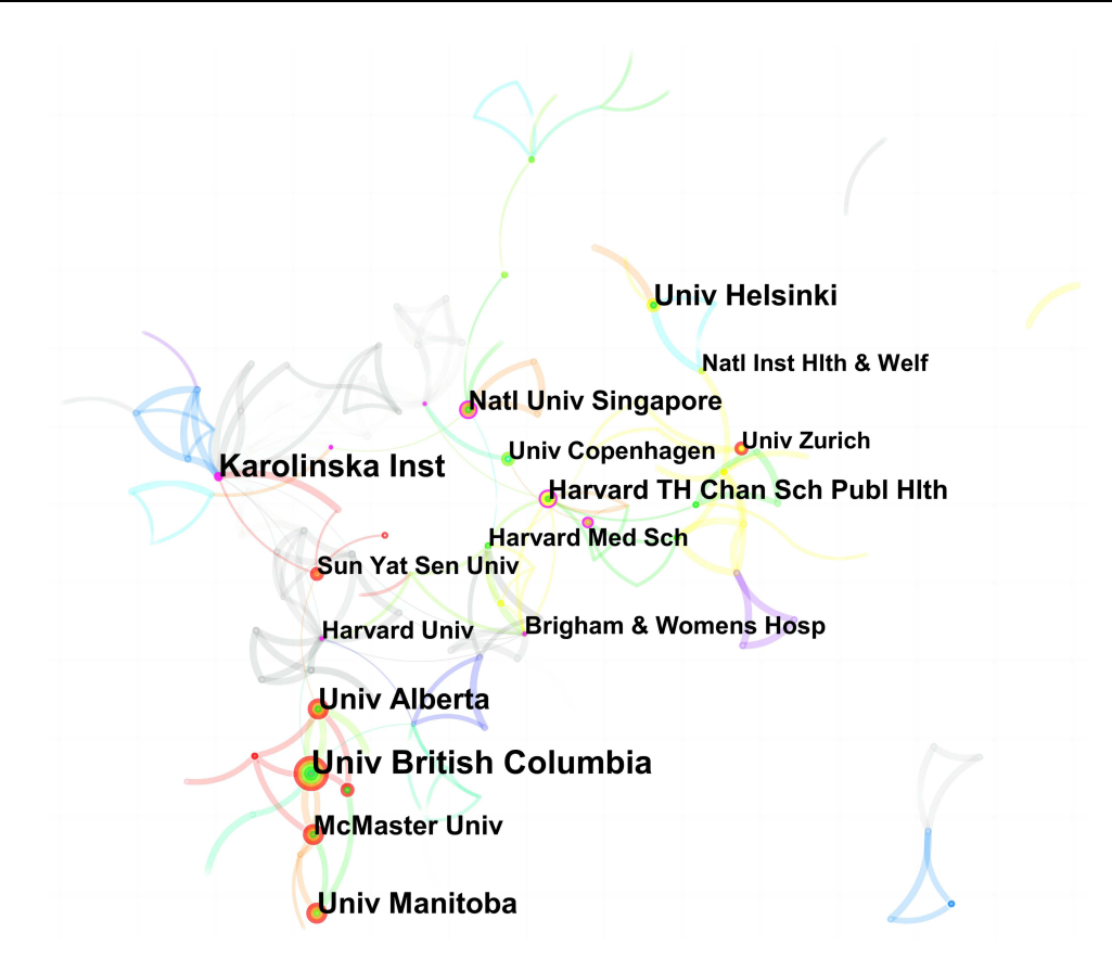
Figure 2 Top 15 collaboration networks of institutions on intestinal flora and asthma.

strong foundation for academic research. Additionally, there has good connections and close cooperation between the authors, which is conducive to the sound and solid development of the field.