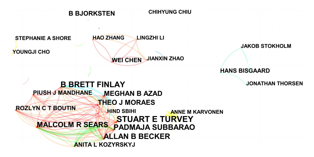
Figure 3 Collaboration network of authors on intestinal flora and asthma.