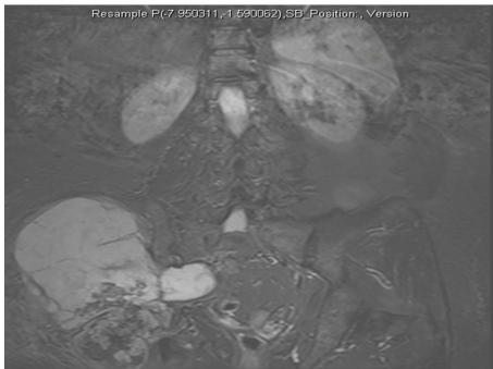
FIGURE 2: STIR MRI of case 4 preoperatively.

of that of chondrosarcoma in primary synovial chondromatosis; that is, 0.06/million per yr, suggesting that there may be 10 new cases of primary synovial chondromatosis diagnosed a year in England. We know no way of confirming this.