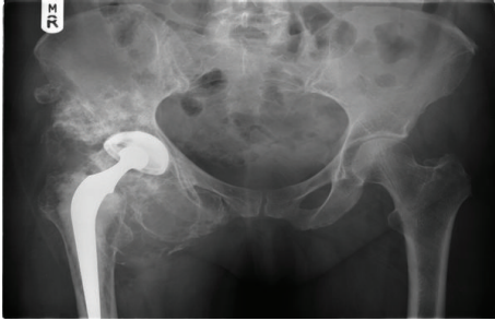
FIGURE 1: Plain X-ray of case 4 preoperatively.