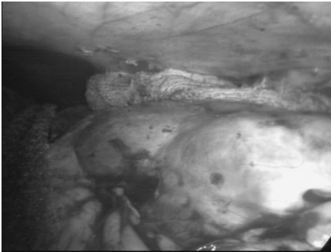
Figure 1. Laparoscopic view showing a large cyst occupying the lower pole of the left kidney with povidone-iodine-soaked gauze pieces placed around the cyst.

nonobstructive clearance, and differential function of 65% and 35% in the right and left kidneys, respectively. The patient was treated with laparoscopic management of the cyst by a transperitoneal approach. The cyst was exposed by careful dissection. Gauze pieces soaked in 10% povidone-iodine were placed all around the cyst as is done in open surgery ( Figure 1 ). The cyst was aspirated completely after puncturing it with a special hydatid trocar-cannula—the Palanivelu hydatid system—to avoid spillage. The details of this system have been described in a case series on laparoscopic management of hepatic hydatid disease by Palanivelu et al. 16 Essentially, this system has a 29-cm-long hollow trocar with a 16-cm-long, 12-mm cannula ( Figure 2 ). The cannula has a dual channel: one for the gas insufflation and the other for the suction. Once this cannula abuts the cyst wall, applying suction to one of the inlets allows the cyst wall to become tightly approximated to the cannula. This prevents any spillage of cyst contents around the site of insertion of the cannula. A 5-mm-long trocar, with suction attached to it (from a second suction machine), is then pushed through the cannula and punctures the cyst and enters it. All the cyst contents are aspirated with a 10-mm suction instrument. The complete evacuation of the cyst is confirmed by placing the telescope inside the cyst through the same cannula.