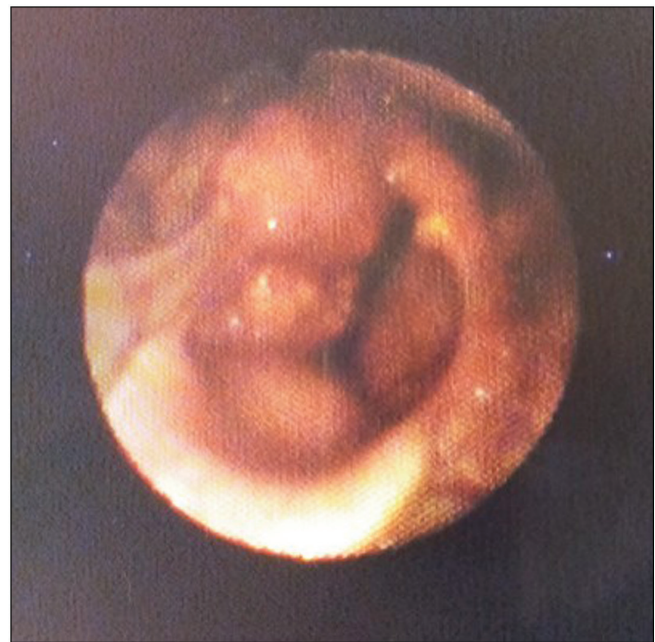
Figure 1: Fiberoptic laryngoscopic picture showing laryngeal tumour more prominent on the right hemilarynx