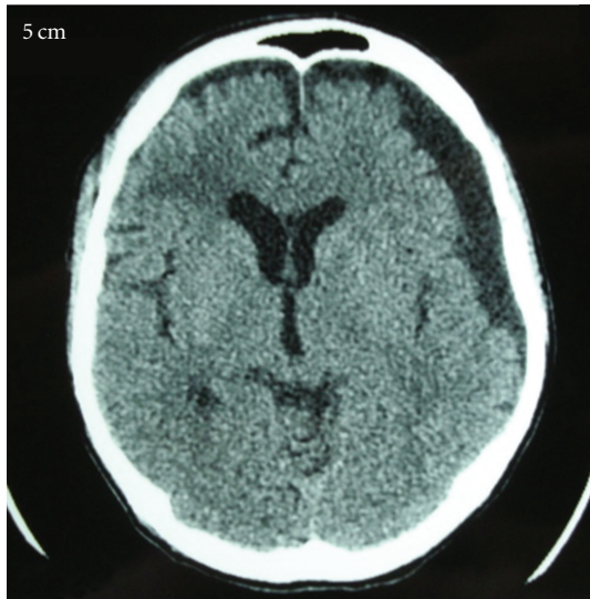
FIGURE 1: CT scan showing an increasing subdural fluid collection with mild mass effect and some effacement of lateral ventricle.