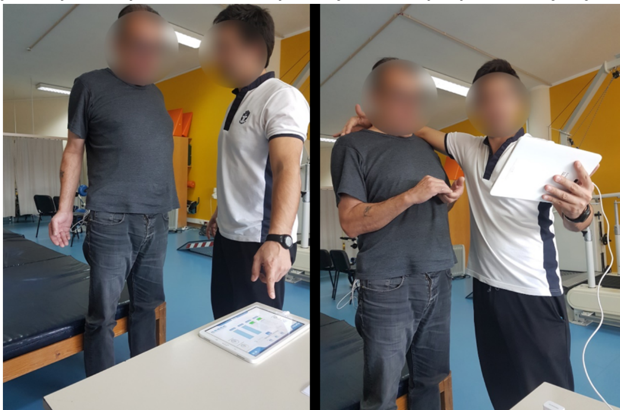
Figure 3. Physiotherapists often use their tablet application to explain to patients how to perform exercises correctly. Notice the calibration octopus in the pocket of the patient on both pictures, and the hand of the therapist correcting the exercise as the patient performs it, on the right image.

When patients had more than one exercise prescribed, it was common to change the setup of the game. In these situations, the therapist was the one bringing other materials that were needed (eg, a Pilates ball, a step, or a cushion).