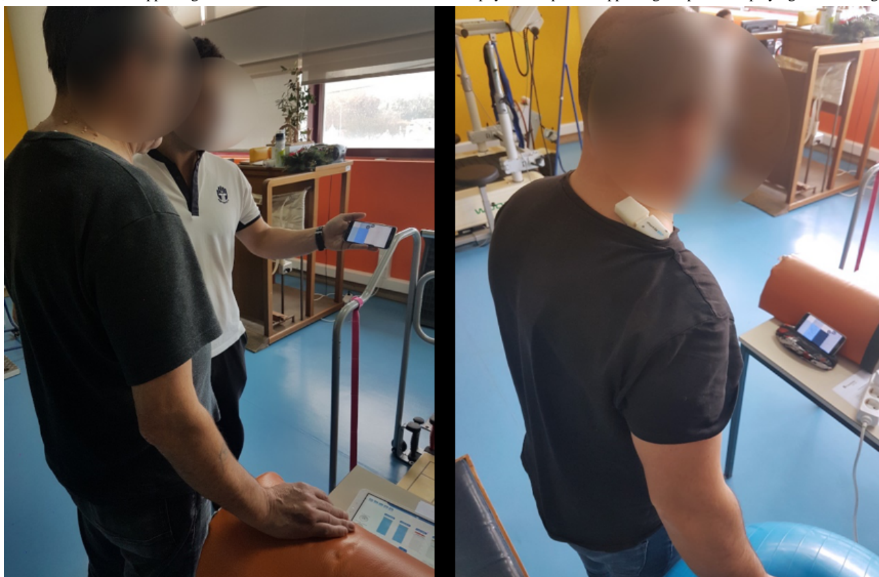
Figure 4. Patient playing the eleRehab serious game with a smartphone and two sensors worn on the back to monitor exercises. Notice the table, Pilates ball, and other materials supporting exercise execution and the active role of the physiotherapist in supporting the patient in playing the serious game.

All patients played the game in the clinic, but they could have taken it home with them. In that situation, the physiotherapist would have taken care of the setup and prepared patients to perform the exercises in autonomy, as expected in previous work [4,25]. The participant role of physiotherapists in preparing home rehabilitation games challenges another accepted idea that patients set up and play rehabilitation games by themselves at home. Considering that therapists are needed to evaluate patients, prescribe therapies, and personalize exercises [3,8,27], it seems unlikely that a game would enable therapy out of the box. Thus, we may observe similar activities of setting up and training before patients start using a serious game at home.