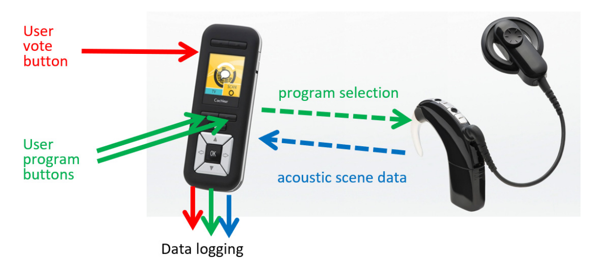
Figure 1. The CP900 sound processor and CR230 remote control used to capture EMA data.