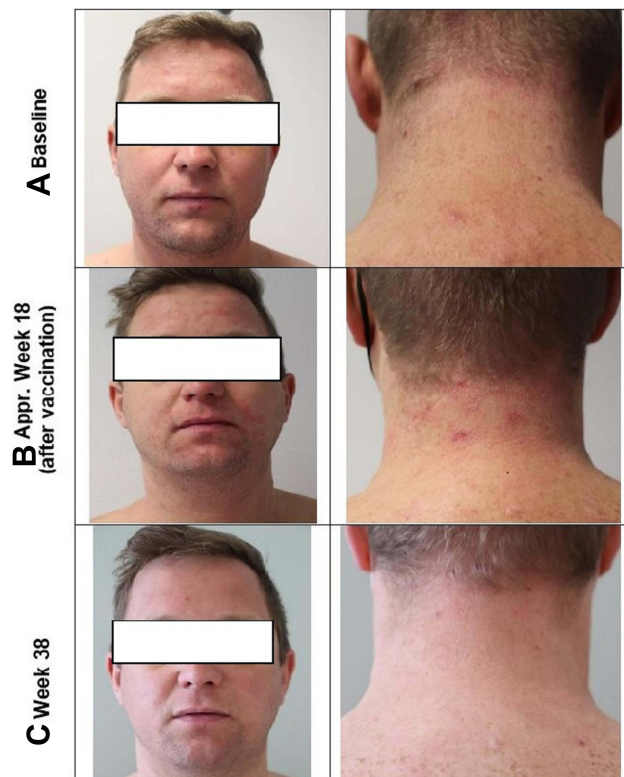
Figure 1 Photographs of a patient with moderate-to-severe atopic dermatitis treated for 38 weeks with tralokinumab (A). Baseline; (B) After approximately 18 weeks (following a vaccination for COVID-19); (C) Week 38 (end-of-study).

During tralokinumab treatment, the patient achieved stable disease and a reduction of the eye symptoms during follow-up. Improvement was observed in most measures of disease severity after 12 weeks of treatment (Table 1). Follow-up visits at weeks 32 and 34 showed that disease measure scores were either maintained or further improved during continued treatment. The last follow-up visit took place at week 38, and tralokinumab continued to sustain clinical benefit during long-term treatment. The evolution of AD symptom and QoL scores from baseline to week 38 are shown in Figure 2. Major improvements associated with tralokinumab therapy were reported for skin lesions (EASI, IGA), pruritus (itch) and other patient-related outcomes (Table 1). EASI was reduced by 75.5% by week 38 vs baseline and