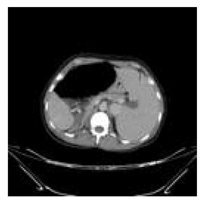
Fig. 2. There was cecal volvulus and this segment has moved to the right on abdominal CT scan.

these controversial options have a high recurrence rate up to %40 and a high mortality rate about %18. ^{9-11}