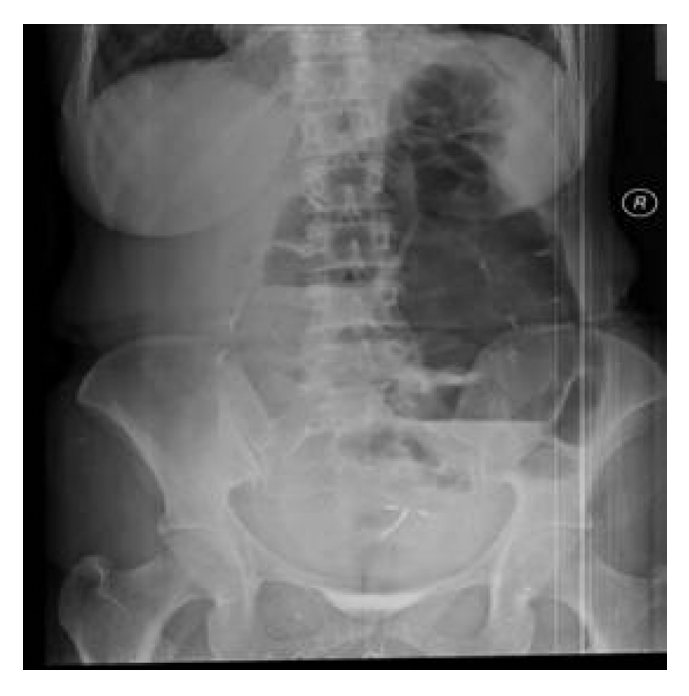
Fig. 1. On abdominal X-ray, the fundus gase was on the right side.